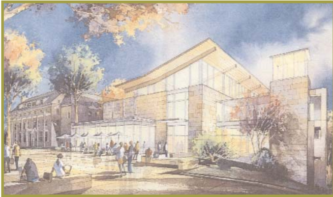
Lawrence University's Campus Center

Construction activity in Appleton continued at a rapid pace during the first half of this year. As of June 30, 2007, the City processed 22 site plans. This compares to 13 for the first half of 2006. Development is taking place in all sectors. Some of the more notable projects include: