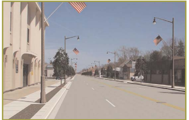
Planned Wisconsin Avenue streetscape

conduit for communication efforts. Partnerships, big and small, will heighten awareness and creativity in dealing with overall disruptions.