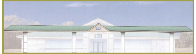
Motomart on West Wisconsin

project involved consolidation of several lots and a connection to Sage Hall. A new pedestrian bridge over Lawe Street and an outdoor plaza are also part of this project.