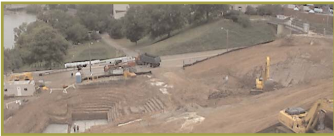
Work has started on site for Lawrence's student center

Work is progressing on the new $31 million Lawrence University Campus Center located between Meade and Lawe Streets. The 107,000 square foot building will