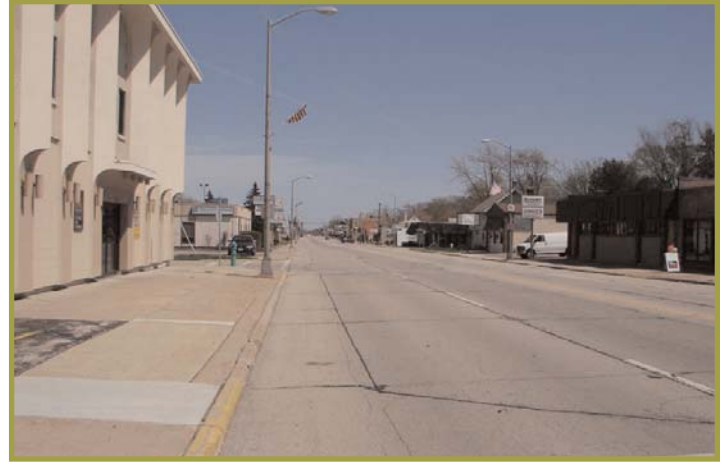
Current Wisconsin Avenue streetscape

The Design Committee will shift gears as it begins to prepare property/business owners for the construction phase. A key component will be to further engage the Appleton Northside Business Association as a prime